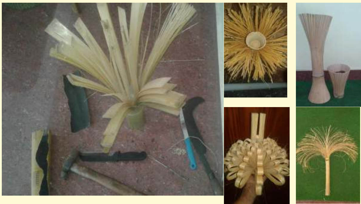
Figure 2: Art and craft applications of natural bamboo strips/slivers bamboo flower wases, floral designs made for decorations using simple tools like knife, big sized needle etc., on a base material . The surface can be given glossy look by polishing sand paper. Also can be coated paint or varnished for more durability and make it more colorful.