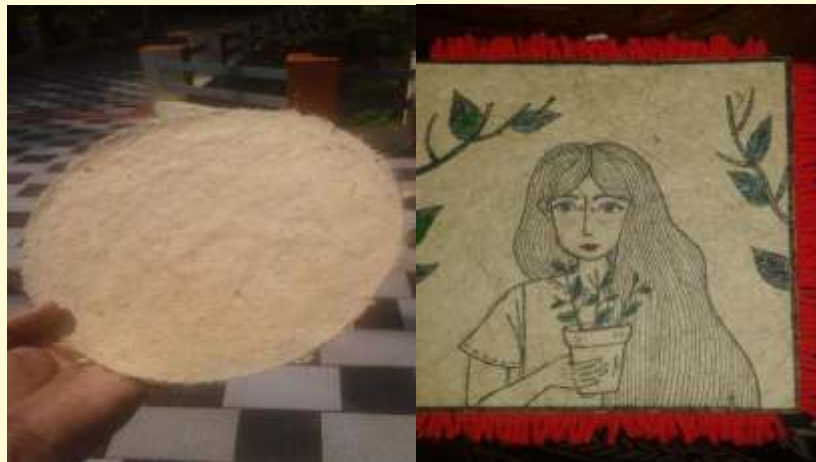
Figure 3: The process involved in making Bamboo paper for Art and craft applications made by natural bamboo pulp with most low cost at home. "Go Green" bamboo papers made into a beautiful painting retaining its natural color and texture which enhances the aesthetic beauty of art.

The author is thankful to Mr. Gurupreet Singh for creating an India's largest Bamboo Resources group on what's app media, stay connected stay safe. For more details: guroofarms@gmail.com and 9927091575